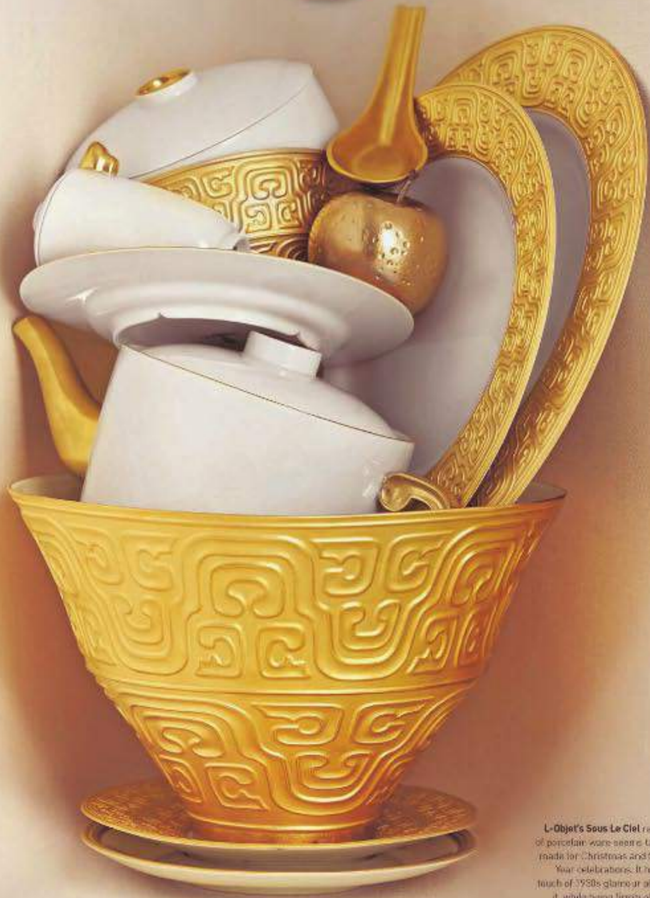
L'Objet's Sous Le Ciel range of porcelain ware seen earlier, made for Christmas and New Year celebrations. It has a touch of 1930s glamour about it, while being lively of the 21 st century. By order from Camilleri Paris. Made in Rabat